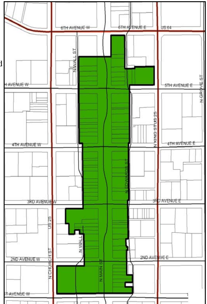
The shaded area on the map above shows the Main Street Historic District.

By establishing this district, the City is responding to concerns that downtown Hendersonville may lose its charm and architectural history. Measures such as local designation, of this and other districts, allows the property owner and City to work together to protect new work necessary for viable businesses to operate downtown. In one respect, it's a historic step to protect our historic town.