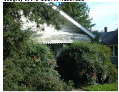
The treatment of site plantings can be very prominent or simply provide a place where the structure takes center stage as seen in the photos below.

The hedges around this home have not been pruned and now may compromise the integrity of the exterior materials.