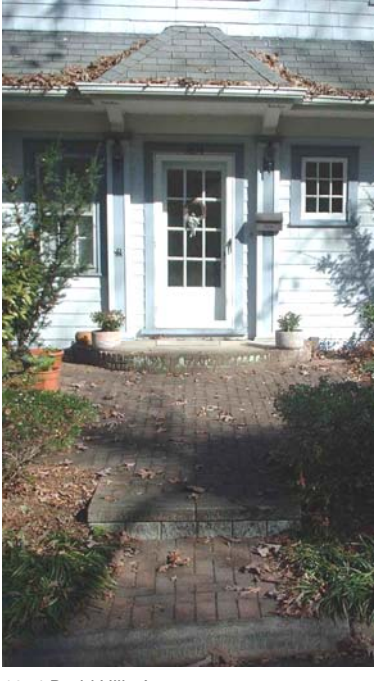
1654 Druid Hills Avenue

Brick pavers add warmth and character to this entry walk.