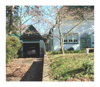
The prefabricated metal carport located next to this home may have been inexpensive but adds little value to the home.