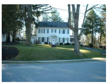
1125 Highland Avenue