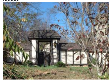
223 Ashwood Avenue

This courtyard wall shares the halftimbering and stucco detailing of the main house