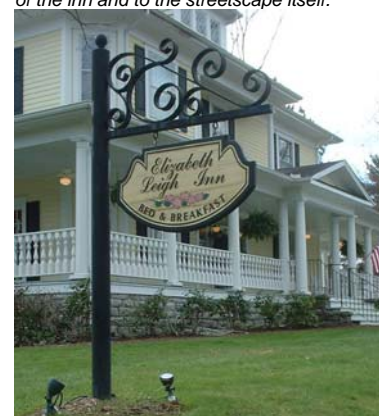
908 4th Avenue West

The material and design of the sign for this historic inn add both to the character of the inn and to the streetscape itself.