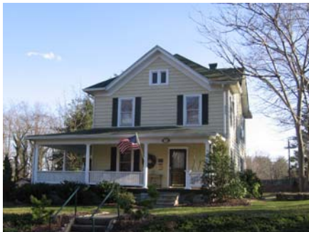
Zebulon Byers House ca. 1920

The Historic Tour of Homes will be held Sunday, April 30 from 1:00 to 5:00 p.m. Tickets are $15 per person and may be purchased at Mountain Lore Book Store, Foxfire Gallery and the Visitors Centers. They may also be purchased the day of the tour at each home. Included in the tour is: