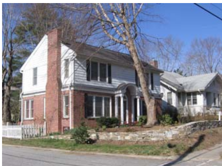
Mary Howell House ca. 1922

This one and one-half story home with a front gable roof and shed roof dormers exemplifies the description Craftsman Bungalow. The front porch has double and triple posts on cut stone piers, solid