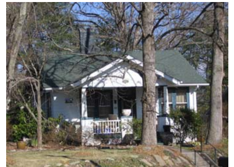
Frazier T. Blair House ca. 1922

This charming bungalow style one-story house with battered posts on brick piers, simple balustrade, and steps to the center front door. The lot features mature growth trees and shrubs. One of many houses in Hendersonville rented to tourists in the forties.