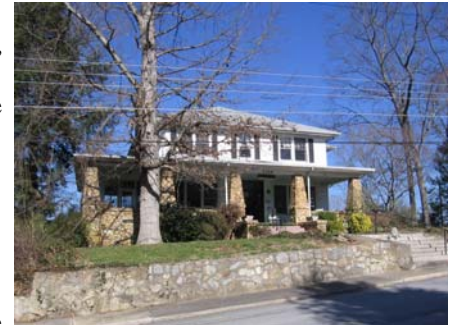
Bonnie Haven ca. 1917