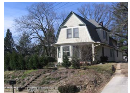
Cecil McCorkle House ca. 1900

This home predates the Hyman Heights neighborhood and is one of the few Dutch Colonial Revival style homes in Hendersonville. The walls are a combination of weatherboard and shingle below the cross-gambrel roof with flared gable ends.