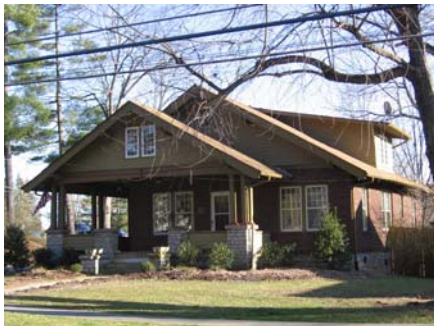
Sidney W. Holdford House ca. 1920

Charming Queen Ann style home with front gable projections. The wraparound porch with tapered columns and a solid wood balustrade helps to showcase the lovely