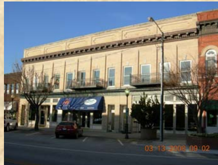
503-511 North Main Street with metal façade (top) and current restored brick façade (bottom)