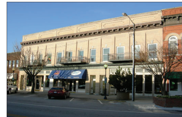
503-511 North Main Street before and after rehabilitated facade.