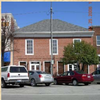
218 North Main Street with empty storefront (top) and current restored brick façade and street-level windows, and doors (bottom)

The Façade Grant Program is a cooperative effort of: