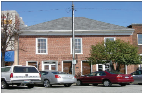
218 North Main Street before and after rehabilitated brick facade, windows and doors.